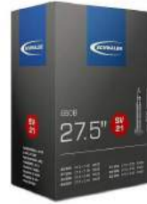
— Inner tube Schwalbe SV21