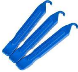
— Tire lever